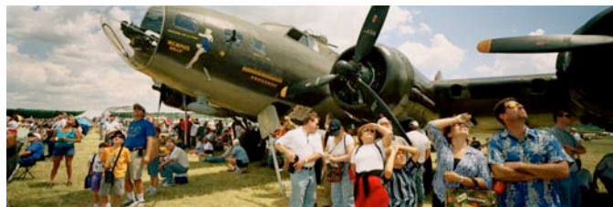
"While Standing Beside the Memphis Belle, Astonished and In Awe, People Make Cash Offerings as an F-16 Fighter...2003."