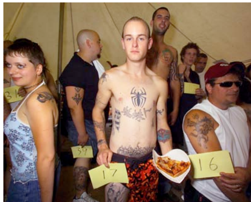
"Pizza & Tattoos, Iron City Tattoo Contest, Lovejoy, Buffalo, New York, 2003."