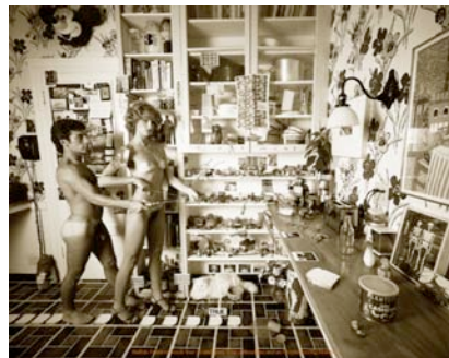
"Buffalo Fashion: True; a Breadline; Watch Your Ps-and-Jews; and an Oxymoron (Big Moron), 1979."