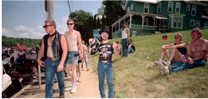
"Leftist Academic Biker and Member of Abused Inner Child Cult, Bike Week, Laconia, NH, 1990."