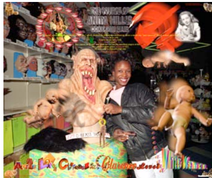
"The Source of Anita Hill's Coke Can Hair, 1994/1998." From series: The Decline of the Left.