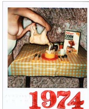
"Chicken Pisher Pitcher Picture, 1974."