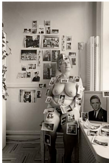
"Mom's Snaps, 1970."