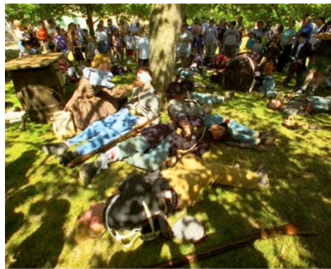
"Pretenders Pretending to Be Wounded and Dead Pretend Watercolor Painting...2003."