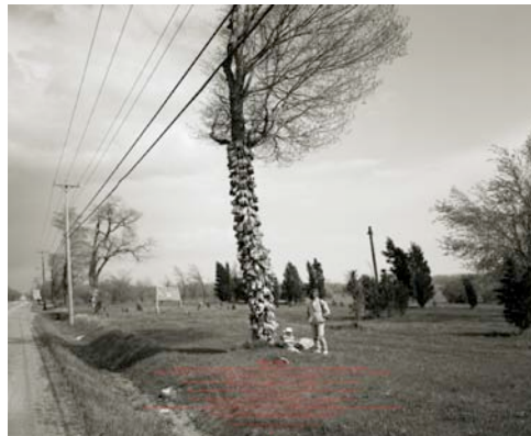
"Shoe Tree and Short Story, 1989." From series: The Decline of the Left .