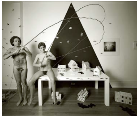
"Ten, Dark, Sweet Ponds. 1979." From: Idiosyncratic Pictures .