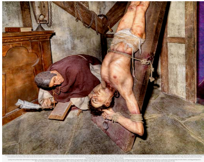
Torture and Confession, Paris, France, 2008.