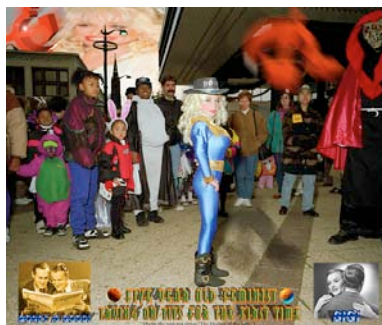
"Five Year Old Feminist Trying On Tits for the First Time, 1993." From series: The Decline of the Left .