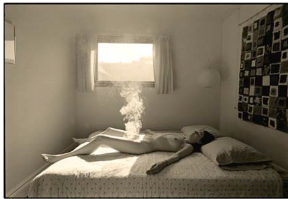
"Fall, Fargo Avenue, Facing the West Side Armory, Buffalo, New York 1969."