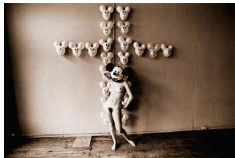
"The Static Electric Effect of Minnie Mouse on Mickey Mouse Balloons, 1968."