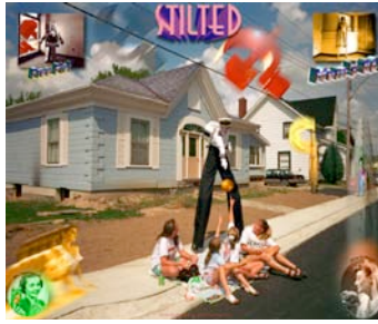
"Stilted, 1996." From the series: The Decline of the Left .