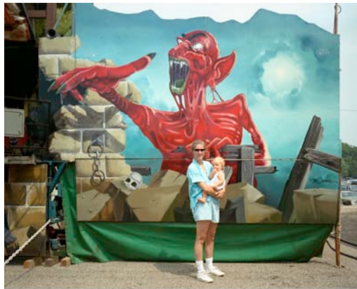
"Red Monster, Erie County Fair, 1987."