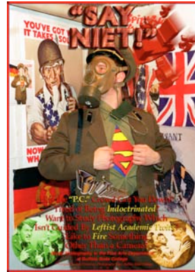
"Is This Guy a Dick Or What?" Poster designed to promote Fine Arts Photography at Buffalo State College.