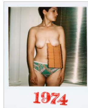
"Pencil Test, 1974."