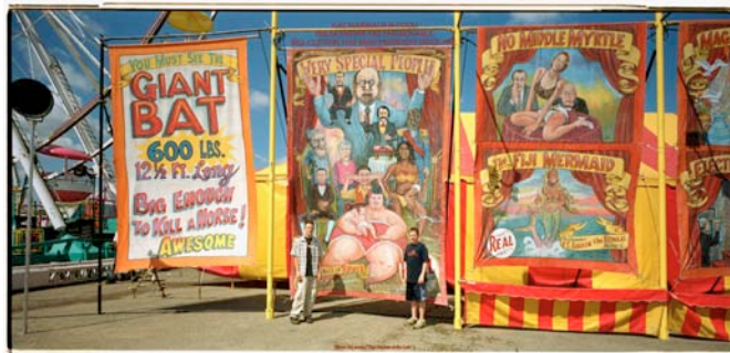
"Freak Shows Are Fashionable Again, and Bill Clinton Gets Blow Jobs in the Oval Office, 2000." From series: The Decline of the Left .