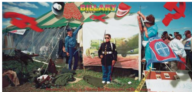
"Billary (President Clinton as a Young Boy Pretending to Be a Leader), 1992." From series: The Decline of the left.