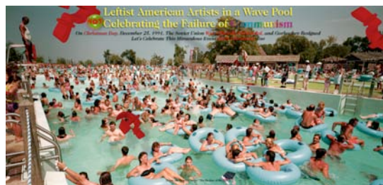
"Leftist American Artists in a Wave Pool Not Celebrating the Failure of Communism, 1993." From series: The Decline of the Left.