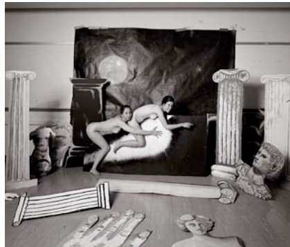
"Radical Feminists Riding the Comet of Postmodernism, 1987." From series: The Decline of the Left .