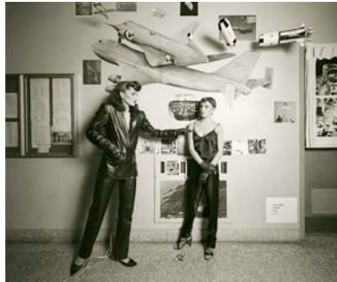
"Two Beauticians Pretending to Be Interested in Science, 1978"